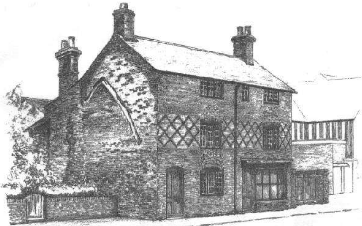
Wigston Framework Knitting Museum